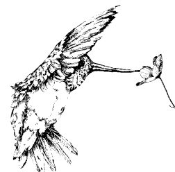
Rufous Hummingbird feeding on an early salmonberry flower

For further details and to learn more about the Corvallis Sustainability Coalition and its activities, visit www.sustainablecorvallis.org .